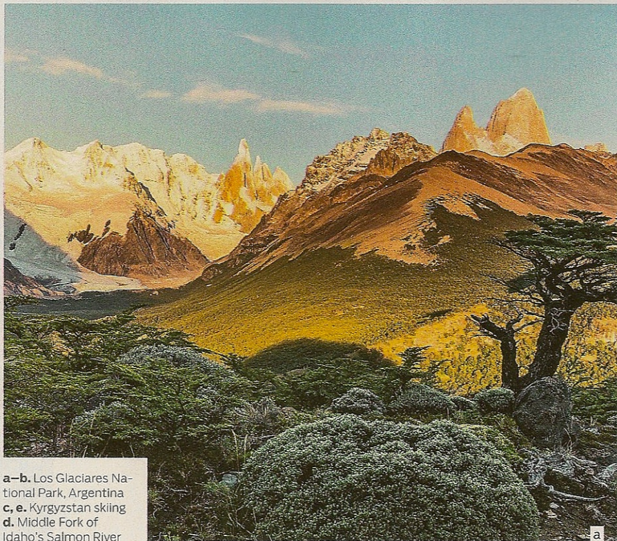
a–b. Los Glaciares National Park, Argentina c, e. Kyrgyzstan skiing d. Middle Fork of Idaho's Salmon River